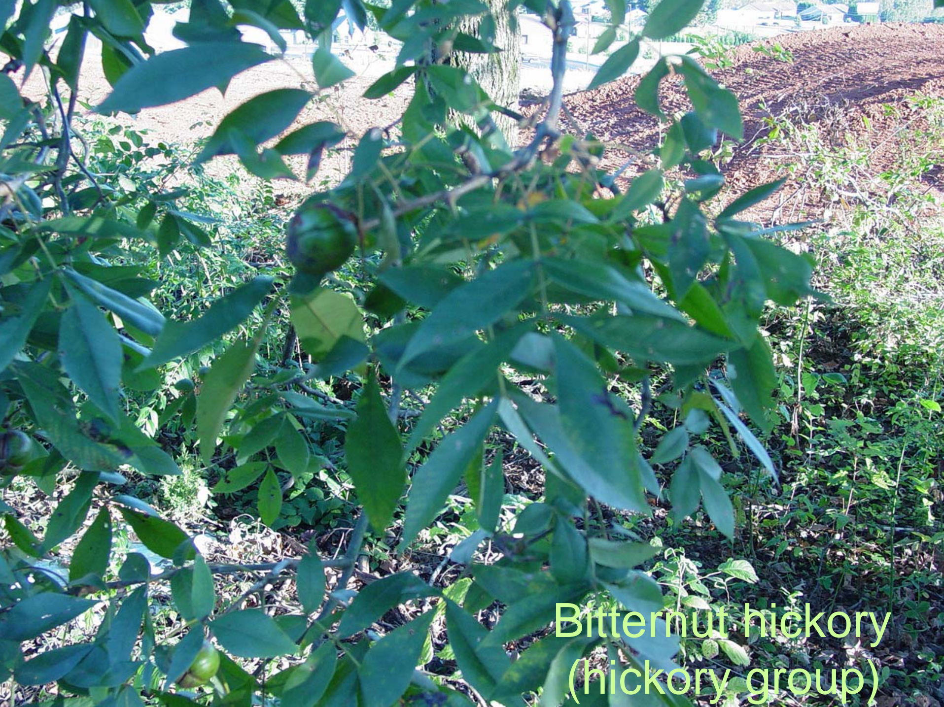
Bitternut hickory (hickory group)